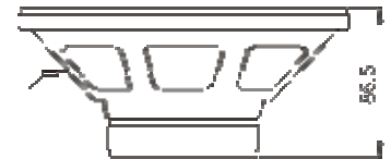
All Dimensions are in mm